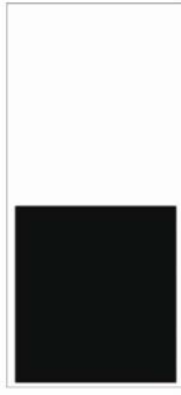
1/2 PAGE 3.5" HIGH x 3.125" WIDE