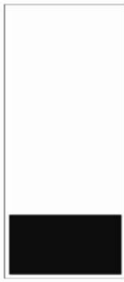
1/4 PAGE 1.75" HIGH x 3.125" WIDE